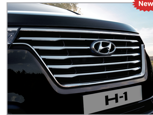
Chrome-coated radiator grille