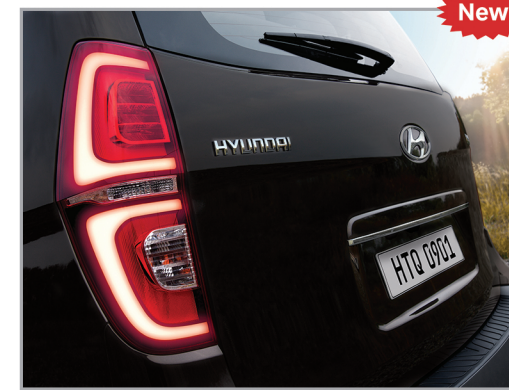
LED rear combination lamps