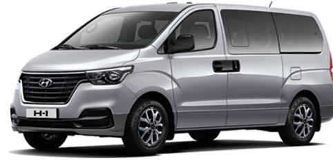
Hyper silver P3S