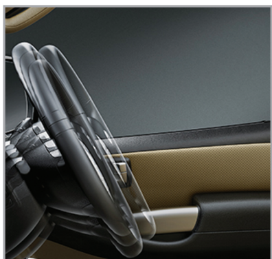
Manual tilt & telescopic steering wheel