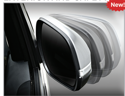
Electric folding outside mirrors