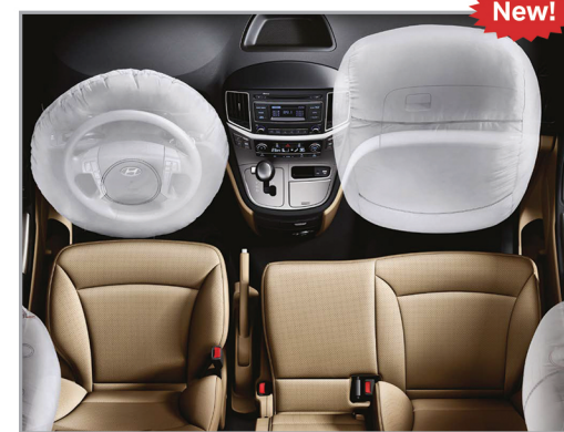
Front dual + side airbag