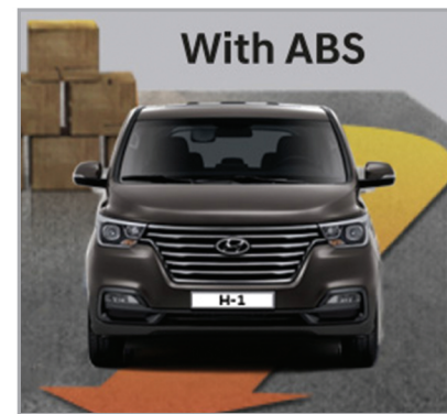
(ABS) Anti-lock breaking system