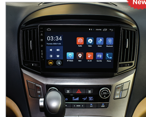
Smart 8" touchscreen AV

Enjoy smart drives by our new android operating system.