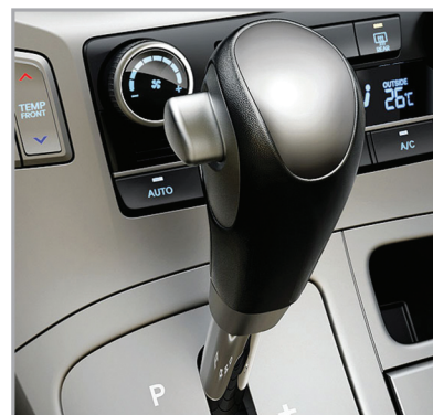
5-Speed automatic transmission