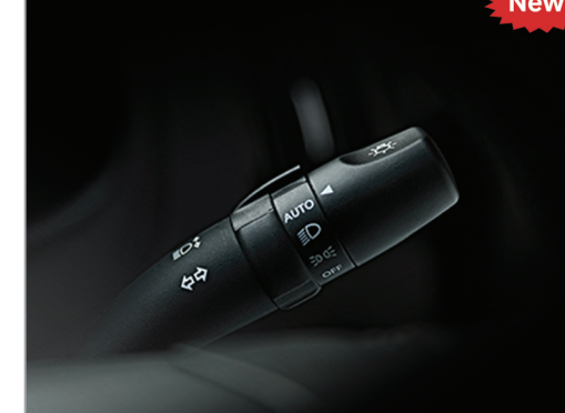
Auto light control