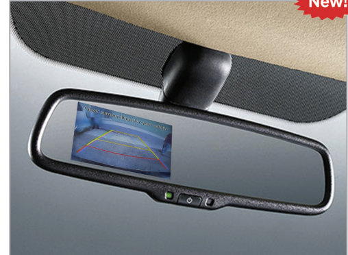
Electric chromic mirror