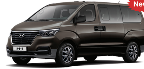
Tan brown TN9