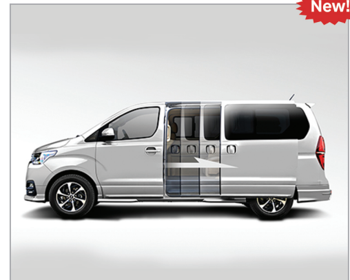
Auto sliding door

An automative one-touch button system to make your life more convenient.