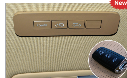
Sliding door auto button system

An automative one-touch button system to make your life more convenient.