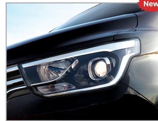
Projection Head lamps