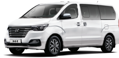
Artic White AW