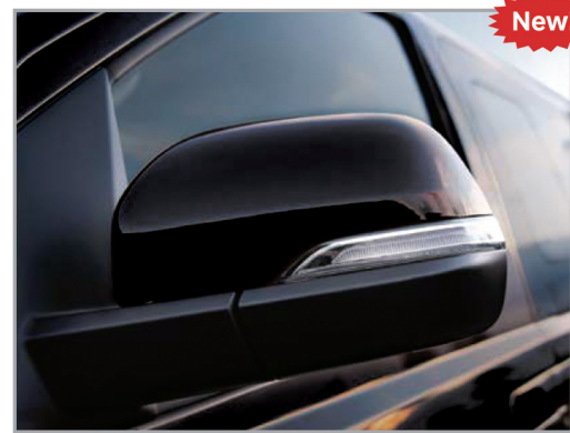
Outside mirrors with side repeaters