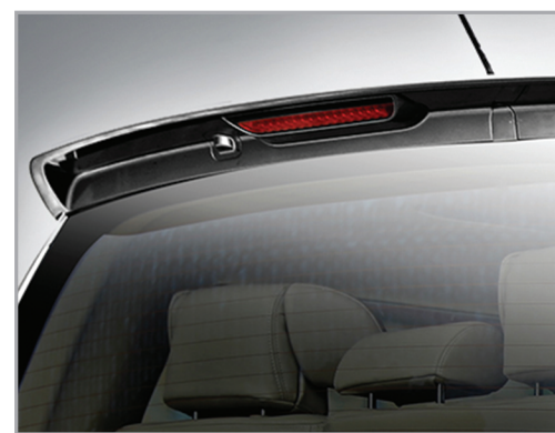
Rear spoiler with High-Mounted Stop Lamp (HMSL)