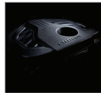
2.5 CRDi diesel engine