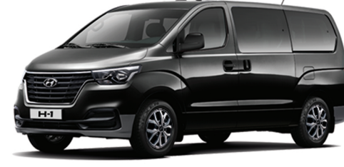
Timeless black PB5