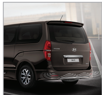
Back warning system