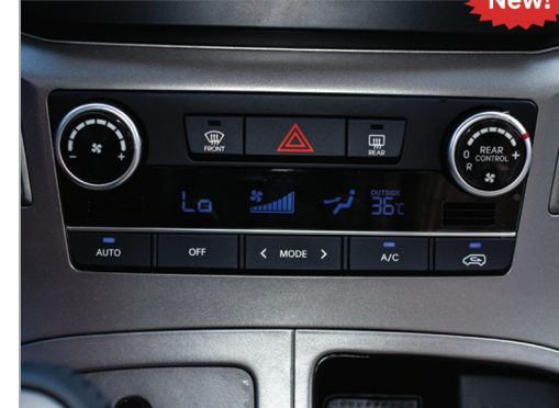
Full auto air conditioning system